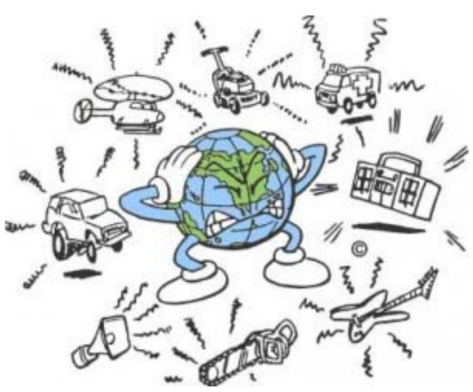
This Photo by Unknown Author is licensed under <u>CC BY-NC</u>