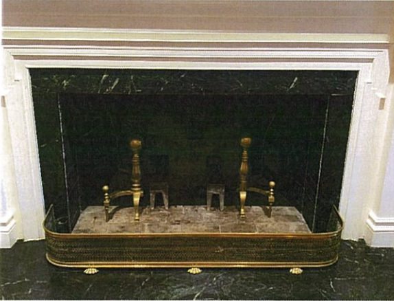
Formal Living Room Fireplace

The woodburning fireplaces in the formal living room and dining room have been plumbed for gas. This was a necessity due to the draft caused by updated HVAC units that would pull smoke back into the house. The antique furnishings and art could be permanently damaged. Mid-Central Plumbing was contracted along with the assistance of Mansion crew to drill the holes through the 36" thick brick bases of the fireplaces to run the proper gas lines for the inserts. The ornamental fire grates that closely match the fire grates in the Grand Hall with coal baskets have been ordered with funds raised by the Mansion Association.