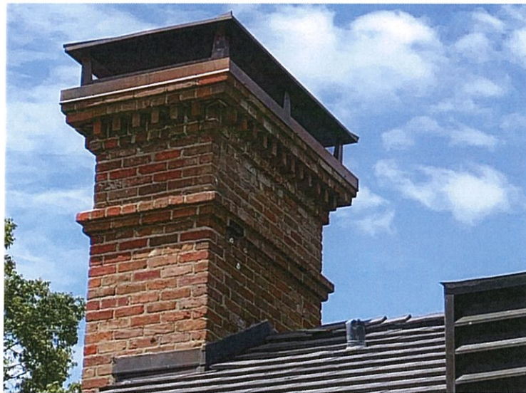
Copper Caps installed

The North Fountain located at the front entrance of the Mansion had excessive amounts of rust accumulation. The South fountain in the Parterre Garden also required cosmetic maintenance on a smaller scale than the North Fountain. Staff and crew soda blasted the old paint and rust then repainted the fountains restoring them at a cost savings of approximately $2,500.