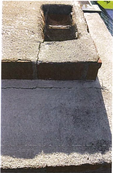
Chimney with cracks/no cap

After investigation, he determined we had an area where the mortar around bricks was failing. We rented a lift to allow our crew access to the area and the repair was completed without outside assistance. The First Lady also discovered a leak in her closet. Bray Sheet Metal was engaged to completely redo the copper valley pans on the roof. During the repair of the mortar, staff discovered there were cracks around the Mansion chimneys and no chimney caps installed to protect them from the elements. Measurements were taken and caps manufactured to correct that error. Chimney caps were added to the two chimneys by Bray Sheet Metal company in October 2020.