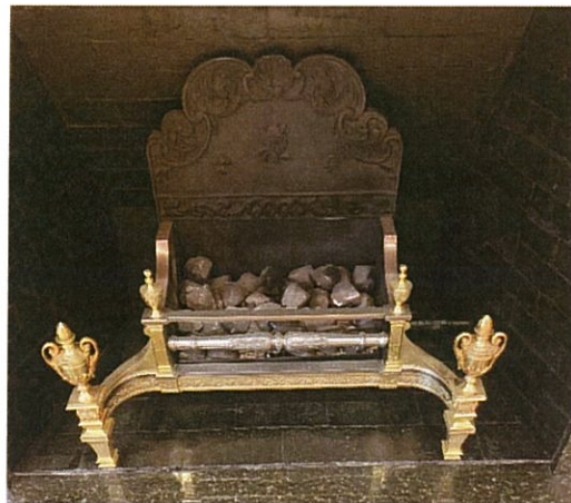
Grand Hall Fire Grate