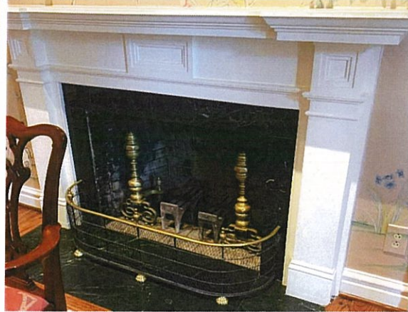
Formal Dining Room Fireplace