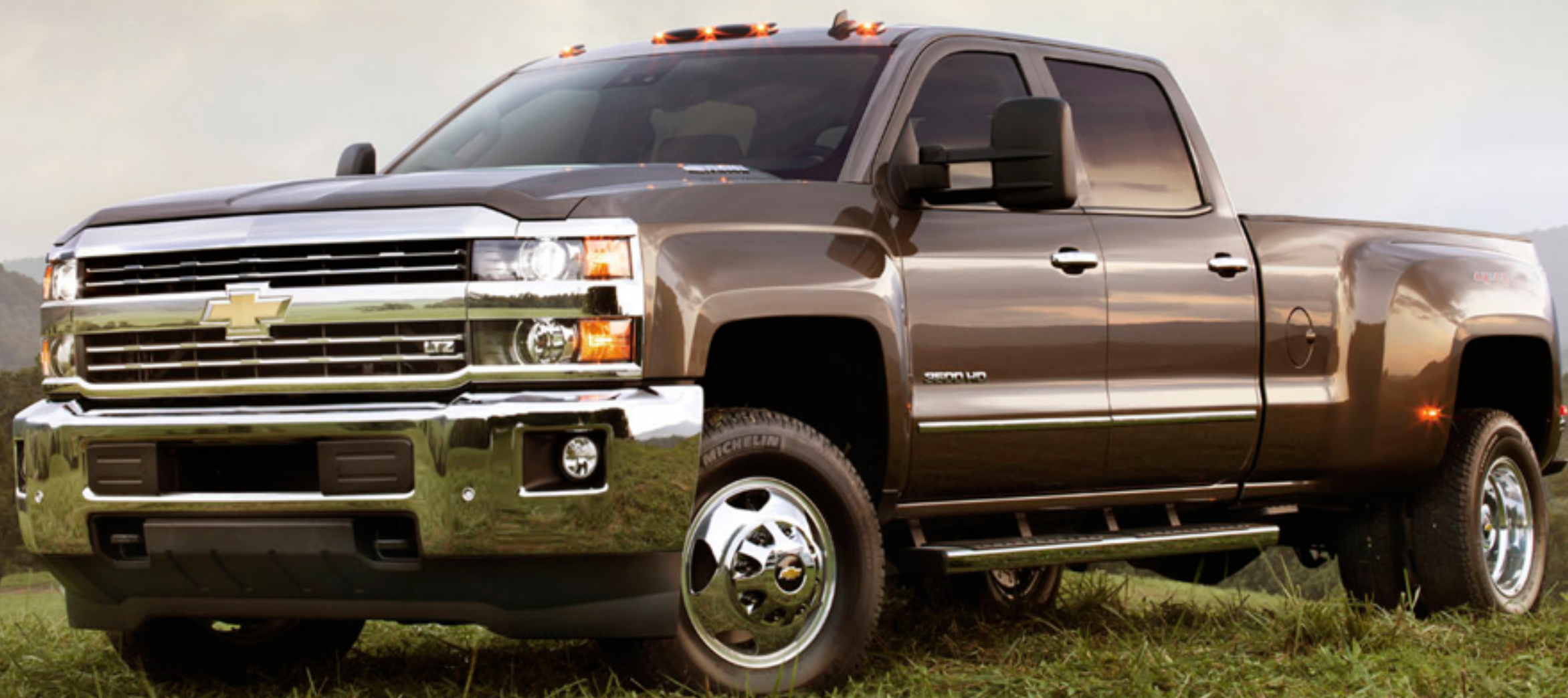
2015 Chevrolet Silverado 3500HD, MSRP $33,730