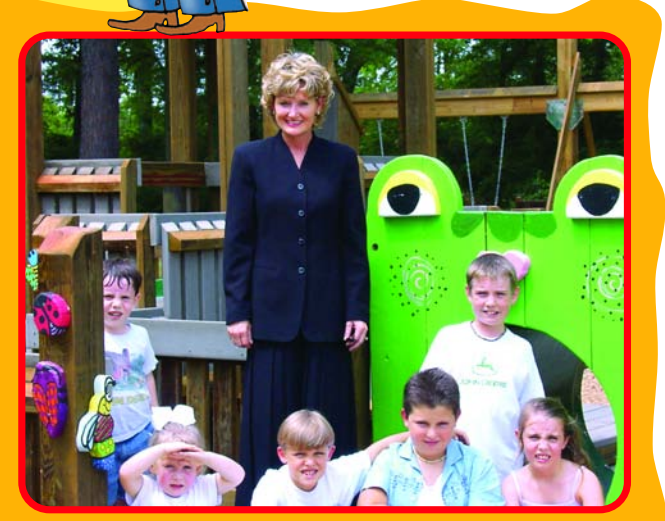
State Senator Cindy Hyde-Smith

Where in the world can you find a nurse , protest marcher , cattle rancher , police officer and Olympic athlete working together to find solutions to our nation's problems? In our federal and state legislatures! State and national legislators are regular men and women who come from all sorts of backgrounds and life experiences. See for yourself by reading about these lawmakers from around the nation.