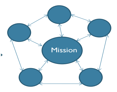
Network centered around the mission