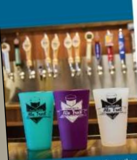
West Mountain Brewing Co. on the Square, Fayetteville