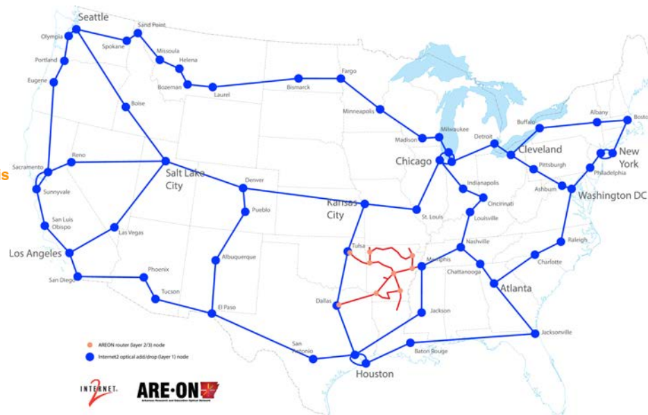
Map of the National Research Network Internet2 and ARE-ON