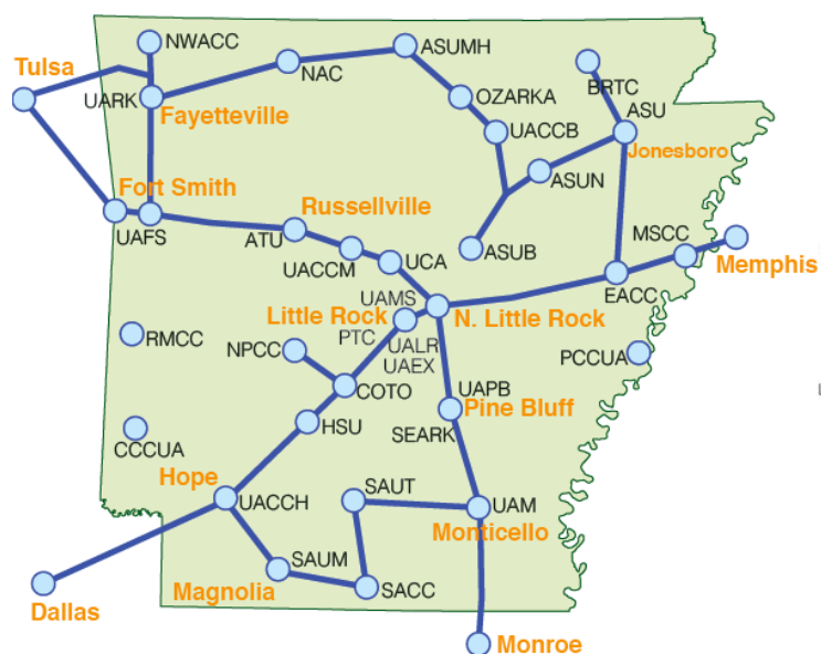
Map of the Arkansas Research and Education Network