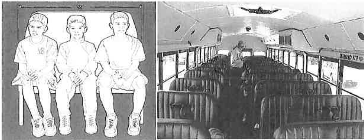
a: A typical 3/3 school bus seat without belts.

There appears to be a way to overcome the loss of capacity due to seat belts: flex seating. “Two manufacturers have introduced school bus seats with lap/shoulder belts on the common 39-inch-width bench seats, which allow the configuration of the belts to be flexible” (NHTSA 2008).