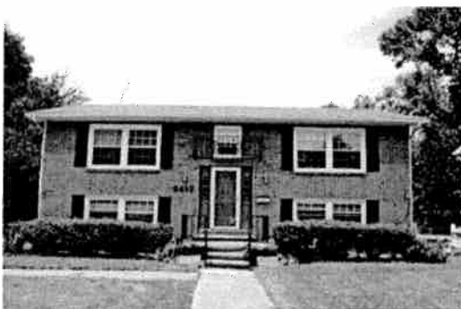
Oxford House Ifford — Charlotte, NC

Oxford House™ is a concept and system of operation to enable recovering alcoholics and drug addicts to live together in a self-help environment greatly increases the odds of sobriety without relapse. By 2009, 1,336 Oxford Houses had been established in 383 cities in 44 states in the United States – a big increase from the 18 local houses that existed when expansion began in 1989. More than 250,000 individuals have lived in an Oxford House since the first one started in 1975. Oxford House, Inc. – the umbrella 501(c)(3) organization – developed an efficient system of replication that relies on individual house charters, organization among houses for mutual support to assure quality control, and utilization of trained outreach workers to teach the standardized system of operations. NIAAA and NIDA have supported independent research that has verified Oxford House's effectiveness. Several of these studies found that 70% to 87% of Oxford House residents were staying clean and sober without relapse. More than 100 peer-reviewed research articles have been published in scholarly journals – the list of articles is downloadable from the www.oxfordhouse.org under "About Us/Resources/Peer Reviewed Published Research List"