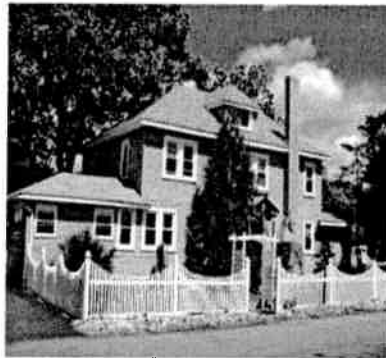
Oxford House Lookout Beachwood, NJ