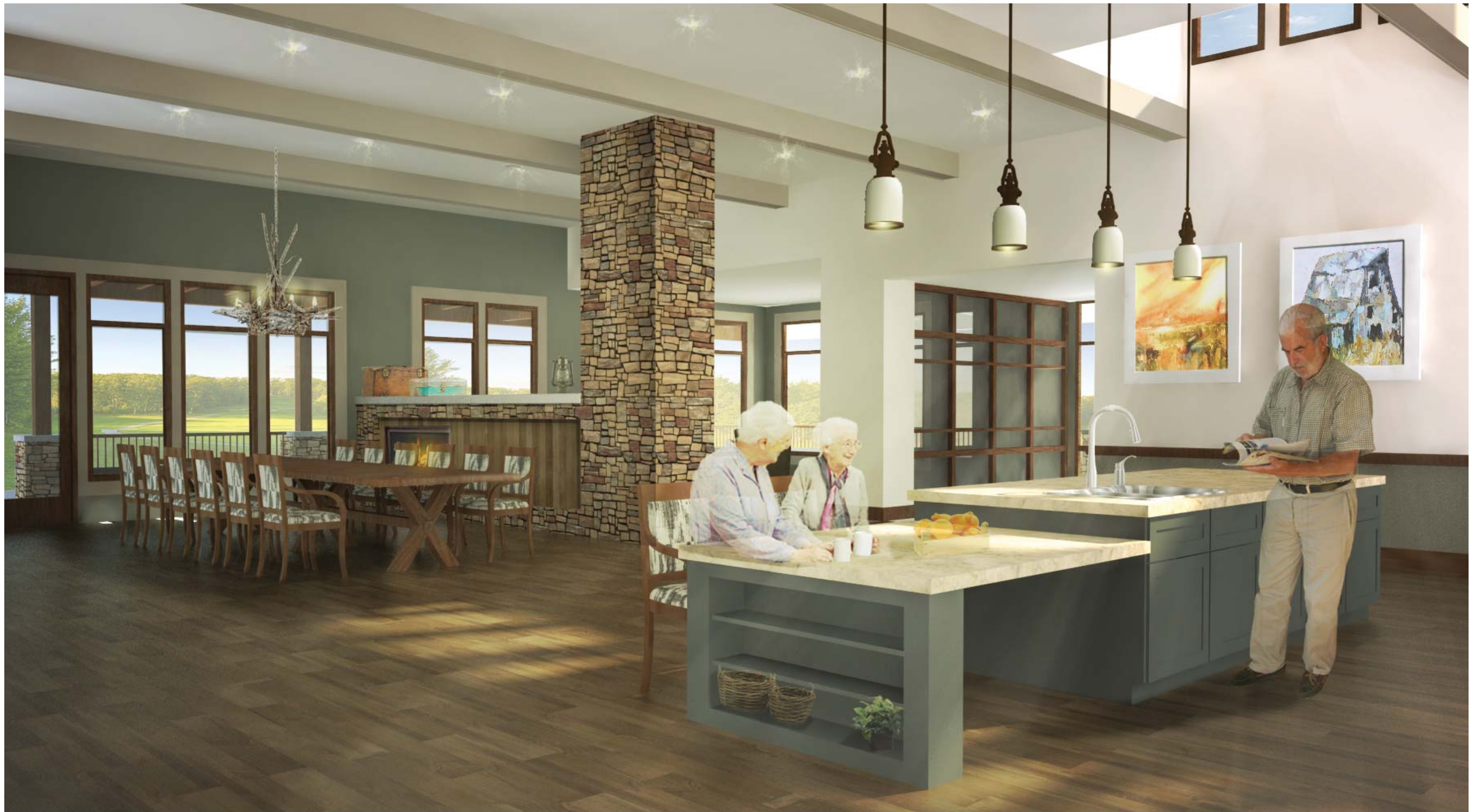
Resident House - Interior View