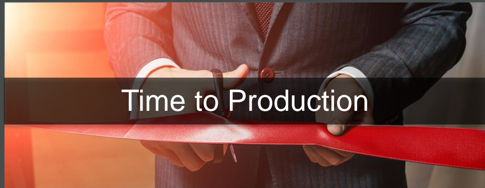
Time to Production