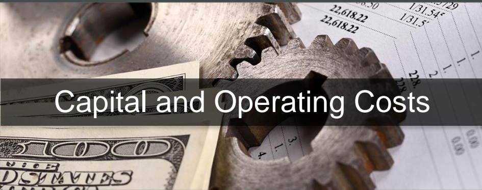
Capital and Operating Costs