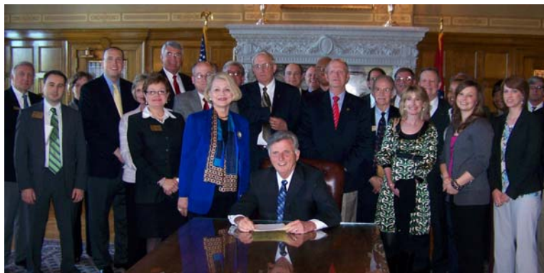
Surrounded by representatives from the Arkansas Department of Higher Education and several state institutions, Gov. Mike Beebe signs Senate Bill 766 into law April 5.