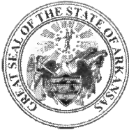
Asa Hutchinson Governor