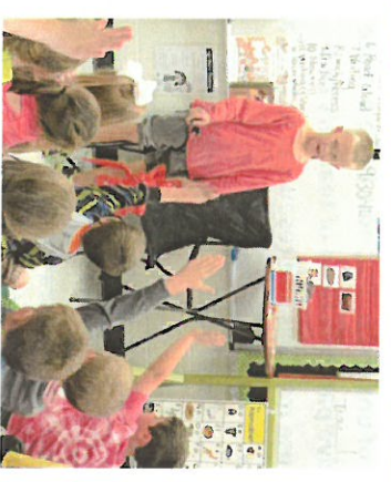
Students are given opportunities to take active roles in daily instruction.