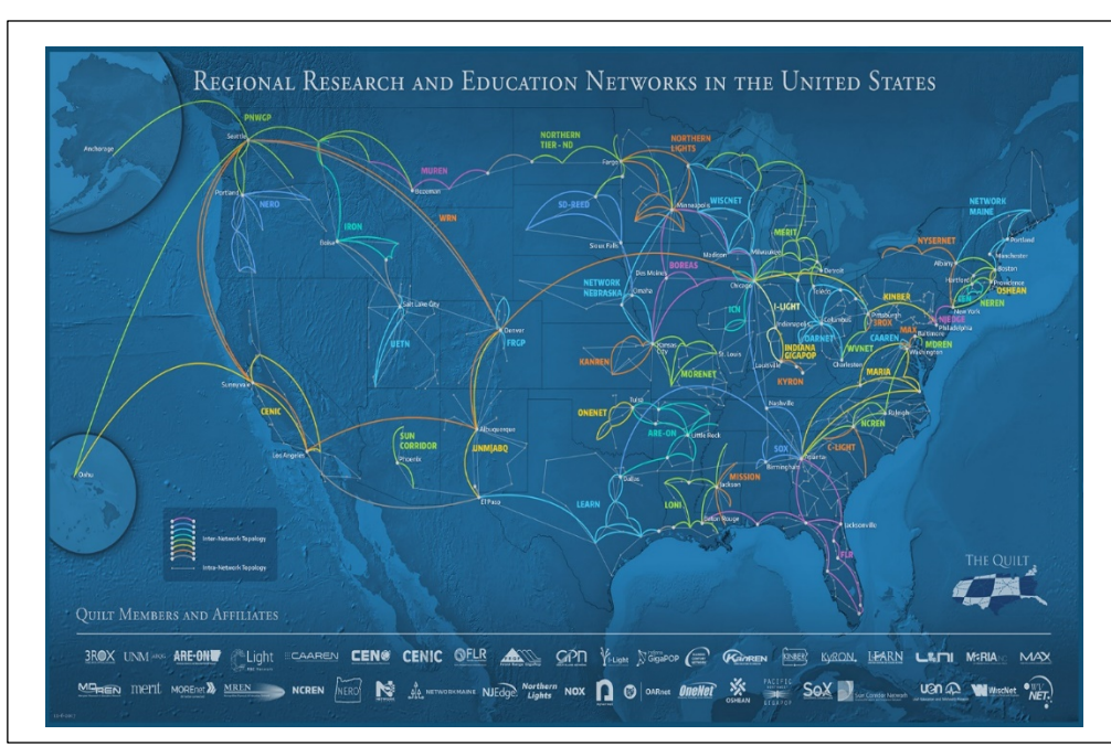
Map of ARE-ON and Other Regional Research and Education Networks in the U.S.