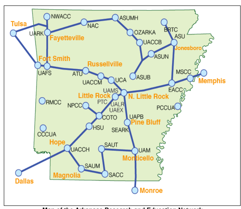
Map of the Arkansas Research and Education Network