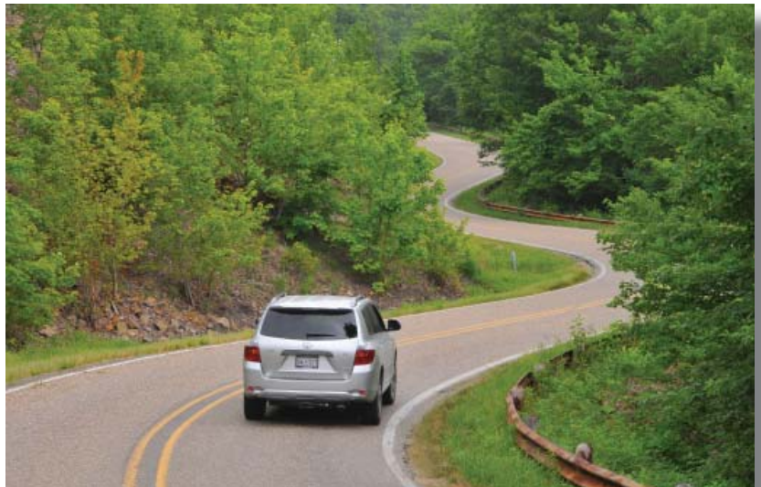
Highway 88, Polk County