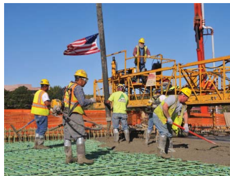
Interstate 430/630 interchange, Little Rock