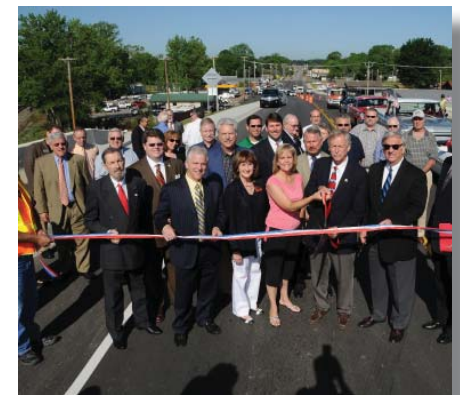
Highway 35, Benton