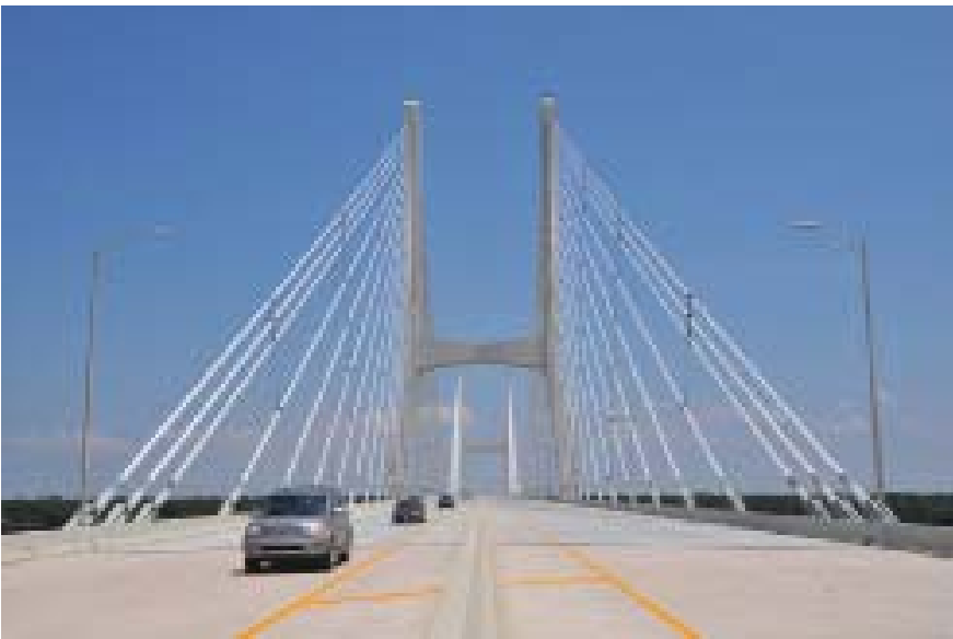
Highway 82 Bridge, Chicot County

Mission Statement: To provide a safe, efficient, aesthetically pleasing and environmentally sound intermodal transportation system for the user.