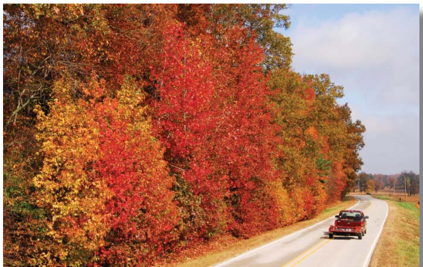
Highway 163, Cross County Crowley's Ridge