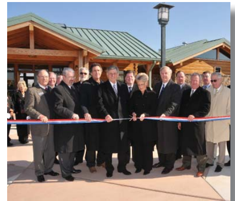
Arkansas Welcome Center, Lake Village

officials gathered in Crossett on December 15 to dedicate completion of work on Highway 82 . The roadway was widened to five lanes beginning at Highway 133 and continuing eastward for approximately 2.5 miles.