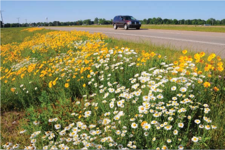
Highway 65, Drew County