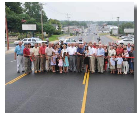
Highway 69, Batesville