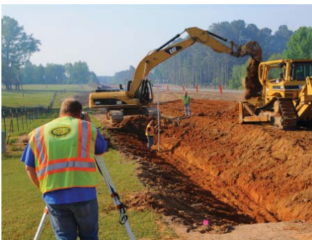
Highway 167, Grant County