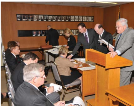
Bids are opened on new construction projects at the Central Office in Little Rock.