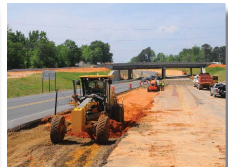
Scenic Highway 82, Union County