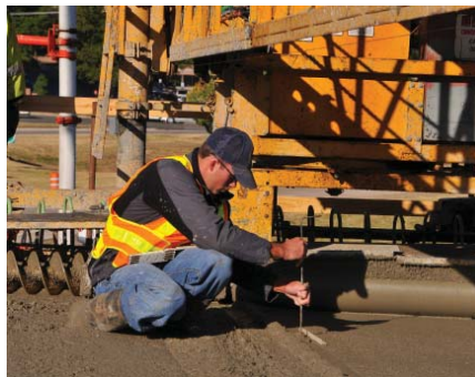
Progressing with construction on the Interstate 430/630 interchange.