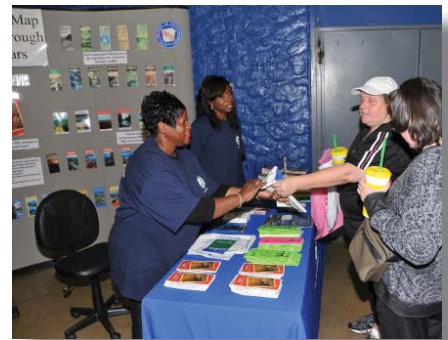
Greeting fair goers at the AHTD booth at the Arkansas State Fair.