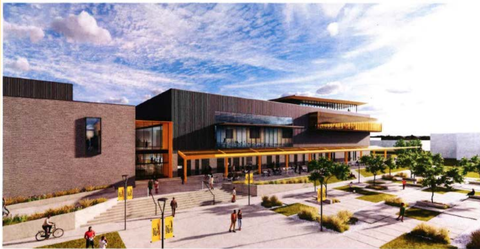
STUDENT ENGAGEMENT CENTER