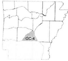
Plate GC-4 (Gulf Coastal Plain)