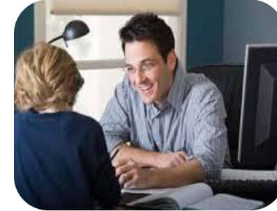
Counseling and Guidance services