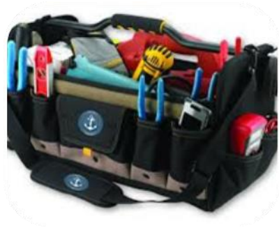
Tools & Equipment