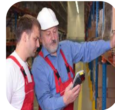
On the job training