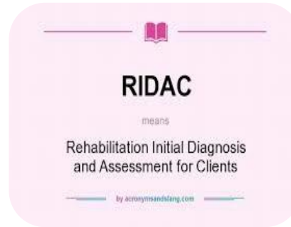
Diagnosis and evaluation of capacities/limit