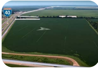
Available Real Estate