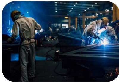
Right To Work State