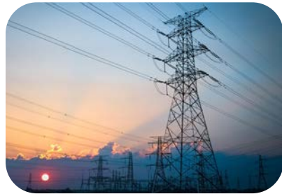
Utilities (Cost and Reliability)