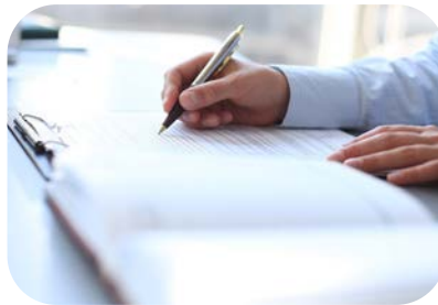
Ease of Permitting and Regulatory Procedures