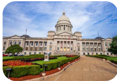
State and Local Taxes