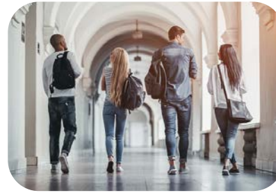
Higher Education Resources and Training