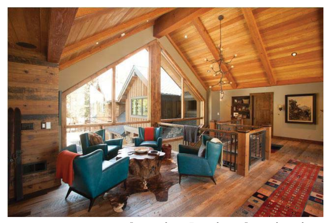
Interior Design Inspiration