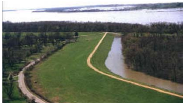
Properly functioning levee

Attention to levee systems in the lower Mississippi Valley became paramount after the death and widespread destruction from the flood of 1927. Thousands of individuals were left homeless and over 1,000 people are estimated to have died of drowning, disease, and exposure. Local levee districts began to be created around the State by various acts of the General Assembly, county ordinances, and circuit court orders. Many of the acts passed by the General Assembly were not codified and with the passage of time no longer can be located by the districts, creating uncertainty as to which laws govern which levee districts. As a result, Arkansas is served by a patchwork of district and privately owned levees with no central oversight of the flood control structures.