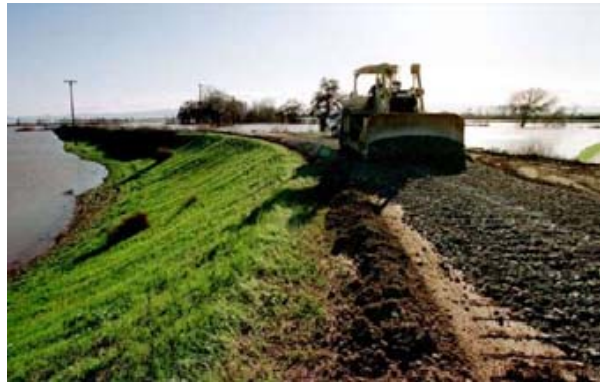
Crown and access road maintenance is performed on a levee.