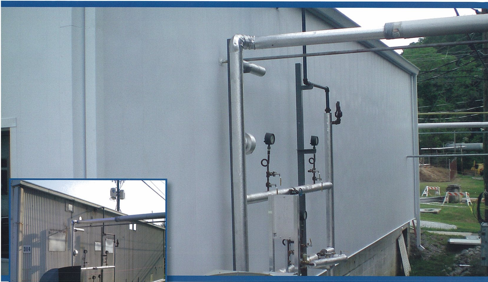
Inset: Before Paramount's involvement, the south side of this building at Oak Ridge National Laboratory was thermally inefficient with a number of penetrations. Main photo: After Paramount completed the retrofit, the thermal efficiency sharply increased.