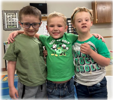
Early Intervention Day Program (Children)