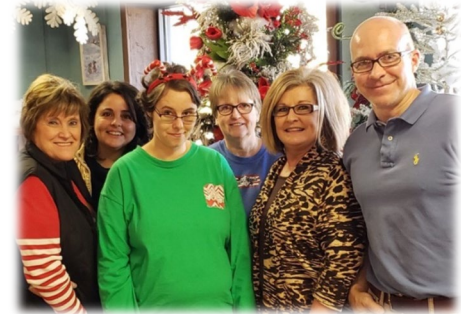
CES Waiver/ Residential Services